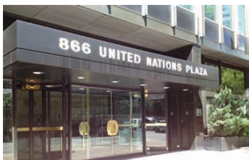
UNCG 866 United Nations Plaza 48 th Street, 1 st Avenue New York, NY 10017

Location: 866 United Nations Plaza East 48 th Street, off 1 st Avenue Suite 265, Second Floor New York, NY 10017